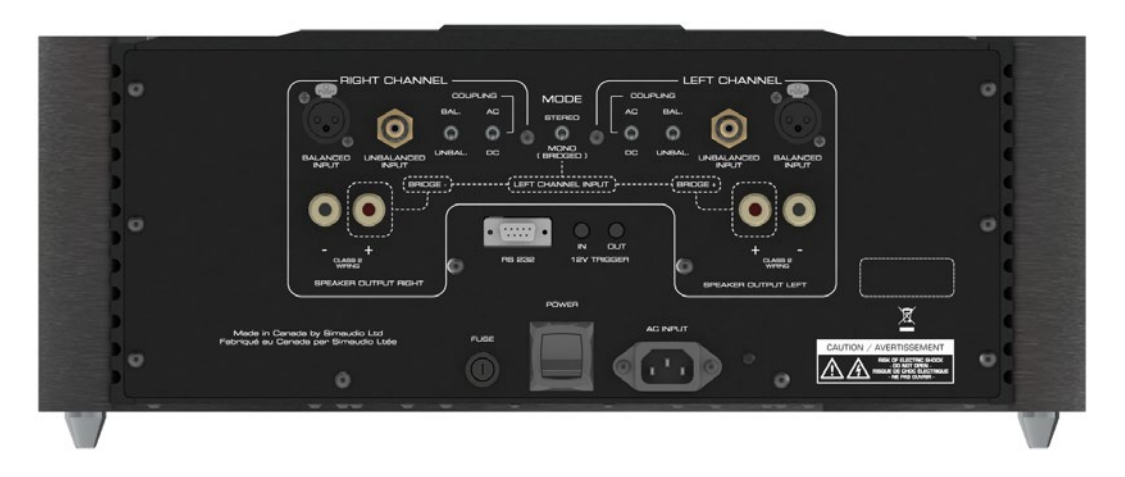
Figure 1: 860A v2 Rear panel