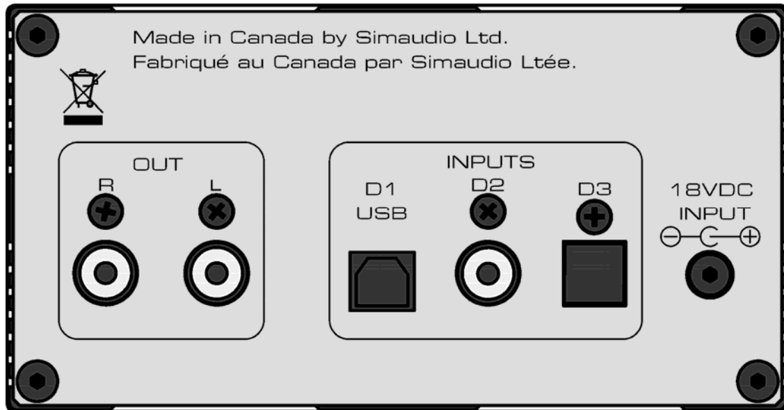
Figure 2: MOON 100D Rear panel

The rear panel will look similar to Figure 2 (above). On the left side is a pair of single-ended RCA analog audio output connectors. You should connect these to a single-ended stereo analog input on your preamplifier or integrated amplifier. Don't hesitate to use good quality interconnect cables.